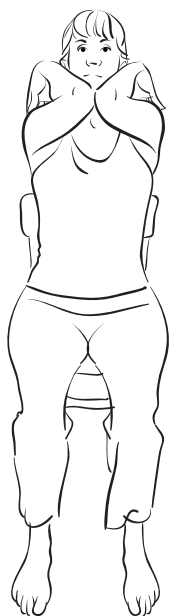
Figure 5.22a. Angel Wings: Forward

25. Angel Wings: Extend your arms forward; then bend your elbows and place your fingertips on your shoulders. On an inhalation, open your elbows out to the sides and draw your shoulder blades together in the back of your body, as if you had a nut on your spine and your shoulder blades were moving together like a nutcracker squeezing the nut. On an exhalation, bring your elbows forward and together (or as close as they'll comfortably come) in front of you, and feel your shoulder blades sliding apart in back of your body. Continue for three to six breaths.